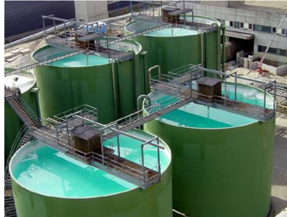
Chemical Brine Purification Plant