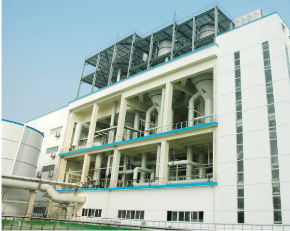
Combined NaCl / Na 2 SO 4 Plant